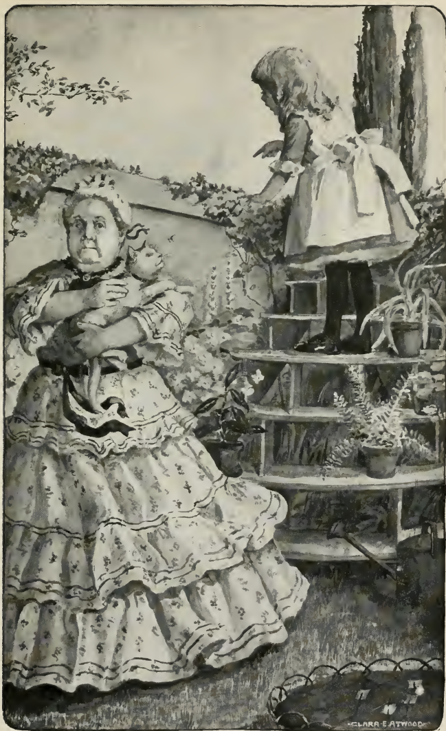
“Miss Henny uttered a shrill scream, caught up her stunned treasure, and rushed into the house.” Page 206.